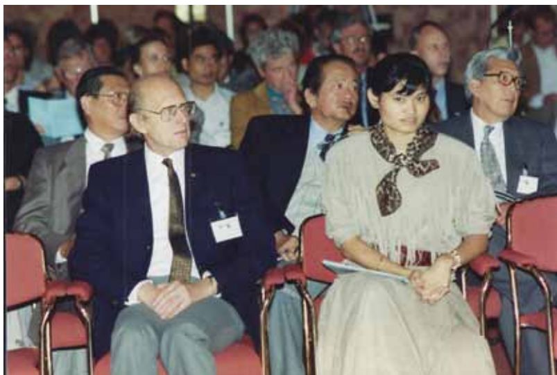
foto 2 Het verenigings-lustrumcongres in congreszaal Krasnapolski met buitenlandse sprekers.