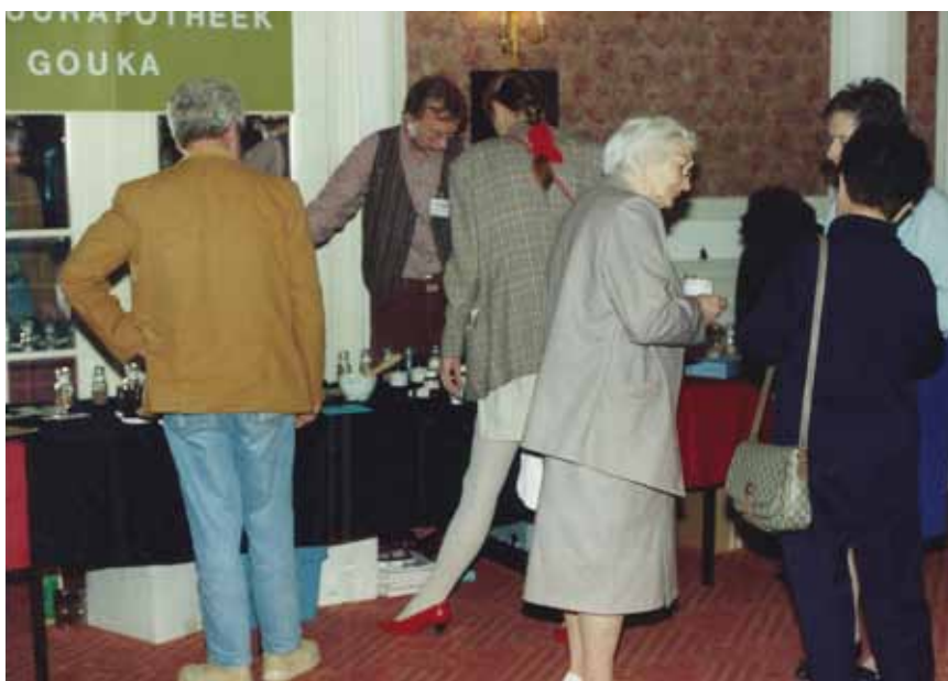
Drukbezochte stands op NAAV-Symposia. Natuurapotheek Gouka, onze trouwe sponsor door de jaren heen.