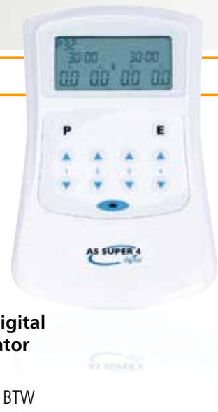
AS Super 4 digital naaldstimulator Aanbieding nu € 199,- incl. BTW