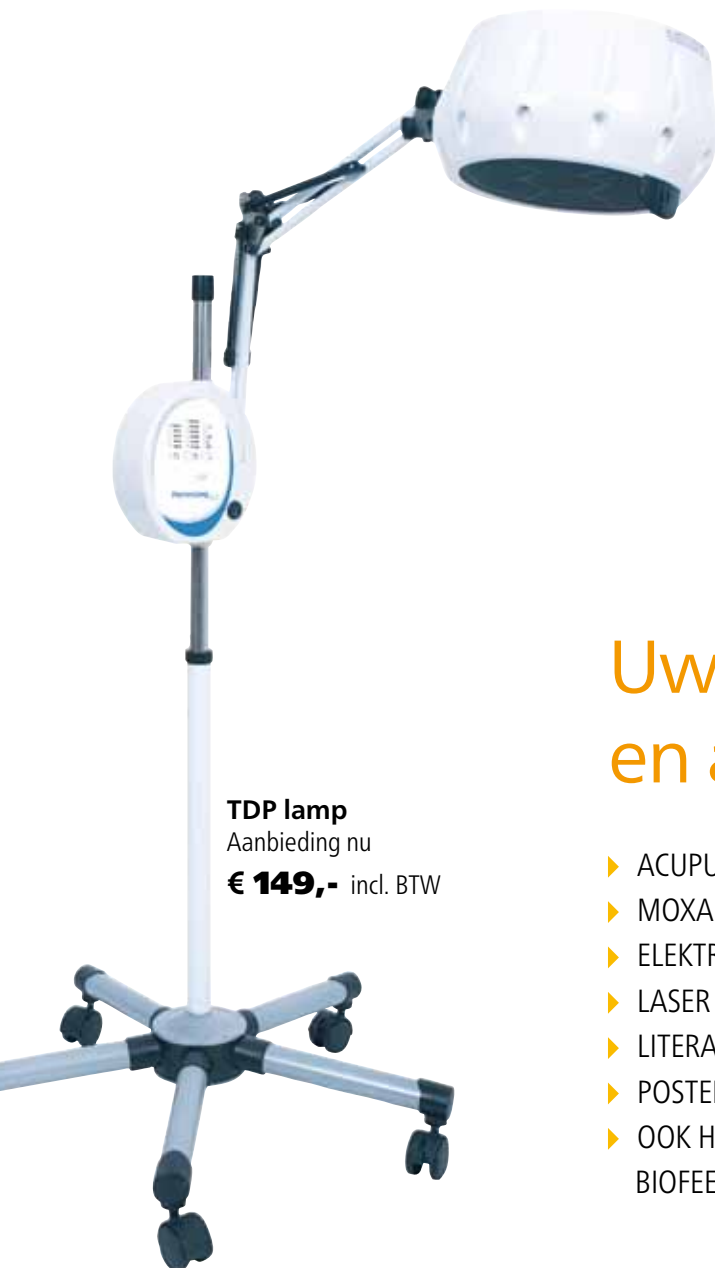
TDP lamp Aanbieding nu € 149,- incl. BTW