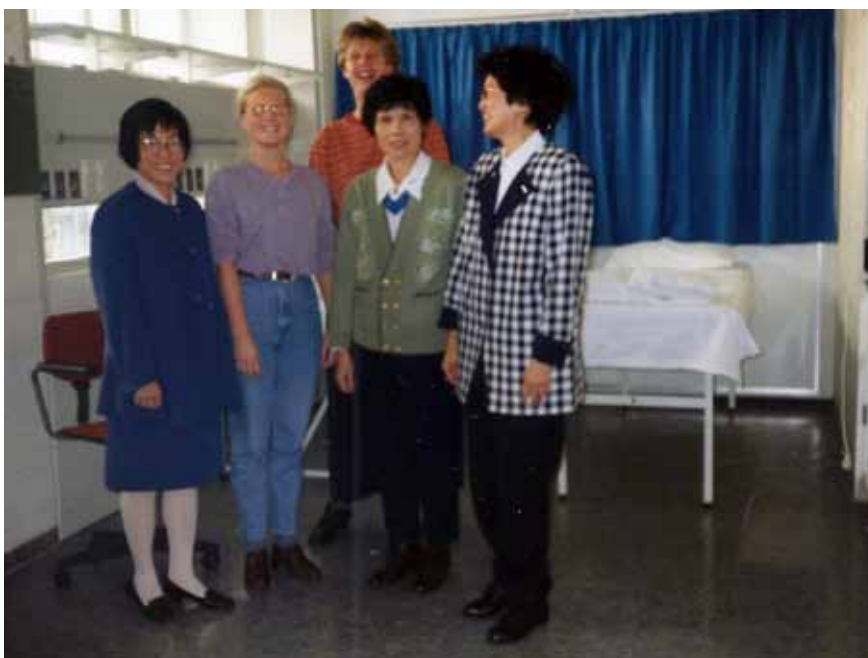
Bezoek van twee Chinese medical doctors aan ons Onderzoeksproject Kosteneffectiviteit Acupunctuur bij Tenniselleboog in de Rotterdamse Universiteitskliniek Afdeling Pijnbestrijding; anno 1996